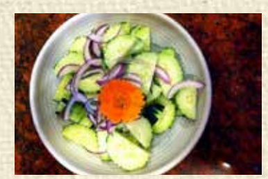
Cucumber Salad $7.95