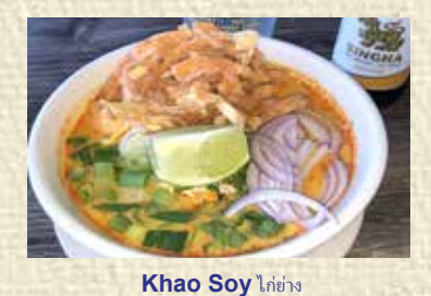
Thai Noodle Curry $19.95 Curry, Egg noodles, chicken, shallots, green onion, cilantro, pickled mustard, topped with crispy noodles.